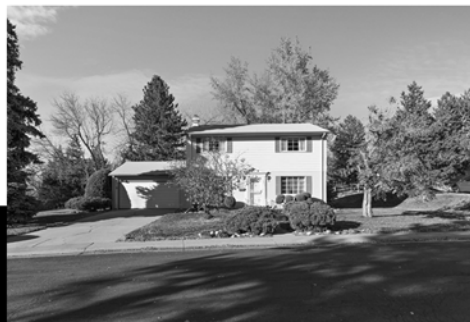
3603 E. Costilla Avenue $410,000 | 4 bed | 3 bath | 2,186 sq ft