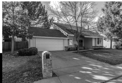
7213 S. Harrison Way $532,500 | 5 bed | 4 bath | 3,235 sq ft

When the time comes to move, partner with proven area experts who go the extra mile to ensure your home sells quickly & for top dollar.