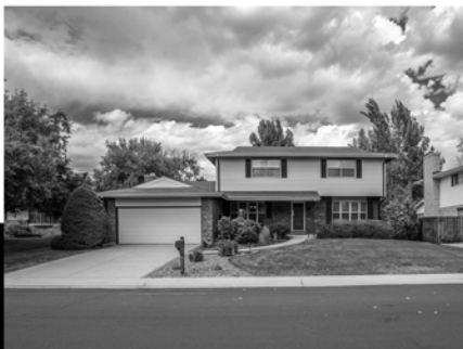
1809 E. Geddes Circle $435,000 | 4 bed | 4 bath | 2,375 sq ft